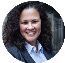
Kelly Speakes-Backman U.S. Department of Energy