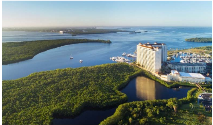
Westin Cape Coral Resort, Florida

In 2019, Marriott International (Marriott) launched the Marriott Infrastructure Resilience and Adaptation (MIRA) program to evaluate climate-related risks across its global portfolio of nearly 8,600 properties spanning 139 countries and territories. Through this comprehensive program, Marriott identified current and future climate risks to its portfolio and has a strategy in place to manage potential impacts, improve resiliency and mitigate losses to stakeholders.