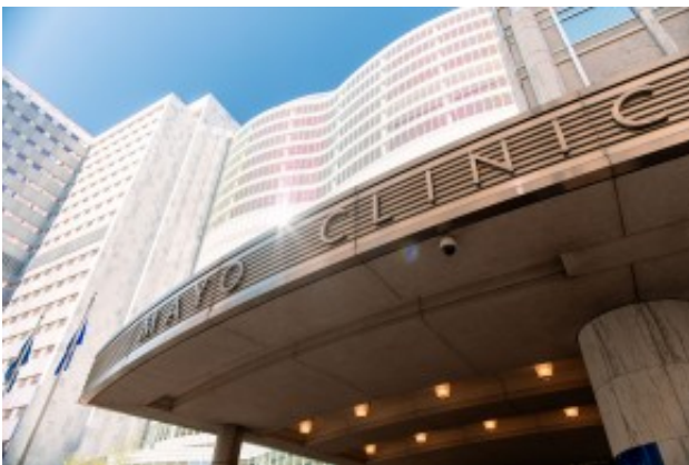
Mayo Clinic Rochester Building Complex