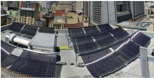
Rooftop upgrades (wide view)