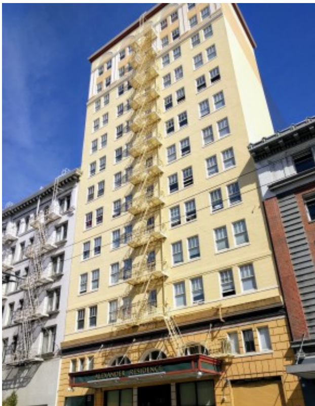
Alexander Residence, front view