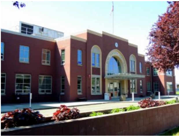
Main Terminal Rear