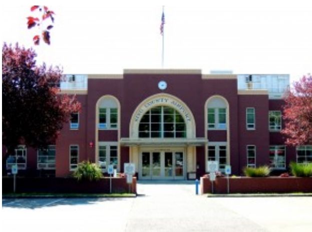
King County International Airport Terminal Building