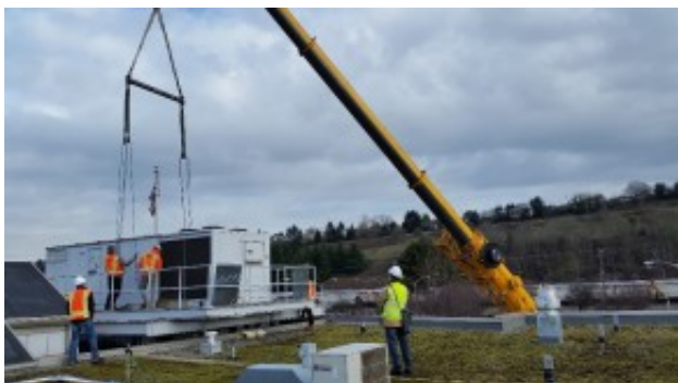
Removal of inefficient RTU