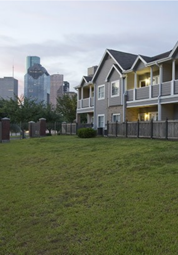
Historic Oaks of Allen Parkway open area