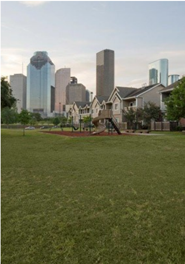
Historic Oaks of Allen Parkway with playground and cityscape