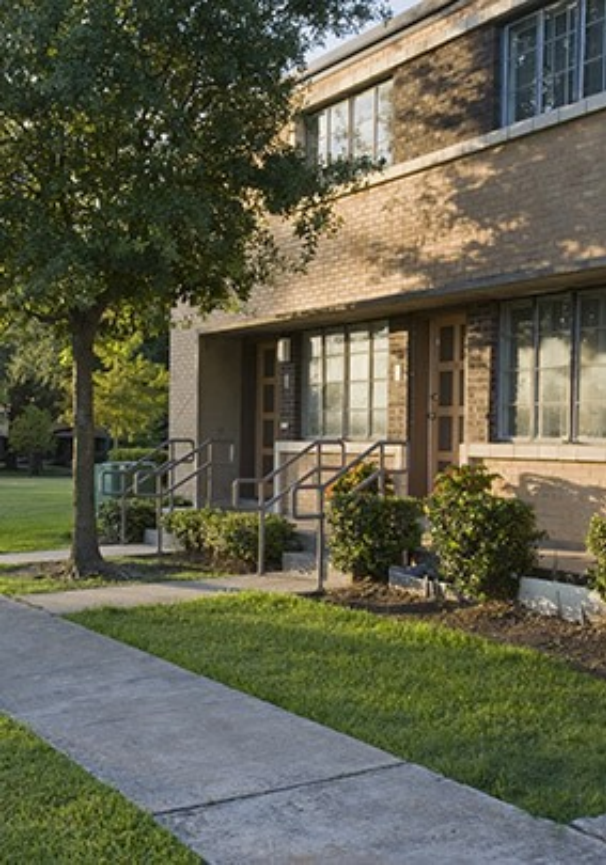
Historic Oaks of Allen Parkway entrance