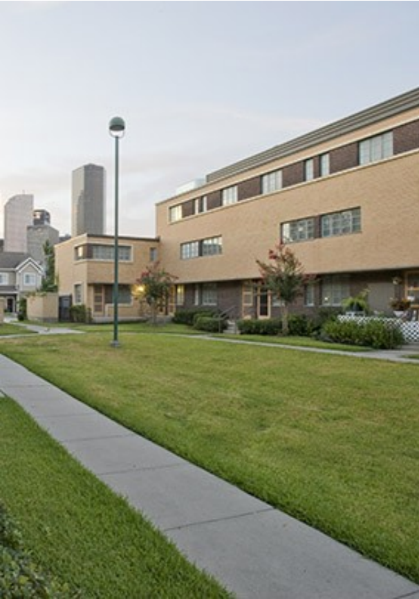
Historic Oaks of Allen Parkway walkway